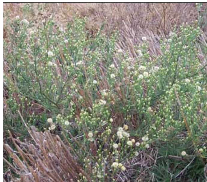
Mature fleabane producing large amounts of seeds.