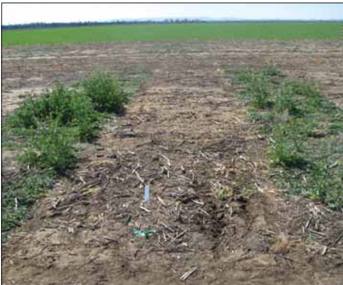
Impact of double knock on two month old fleabane (centre) compared to untreated.