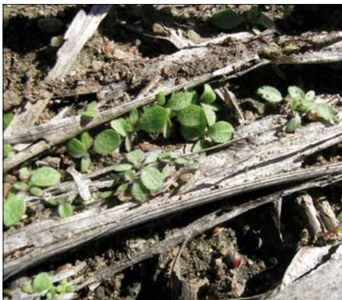
Fleabane seedlings emerging from under stubble.