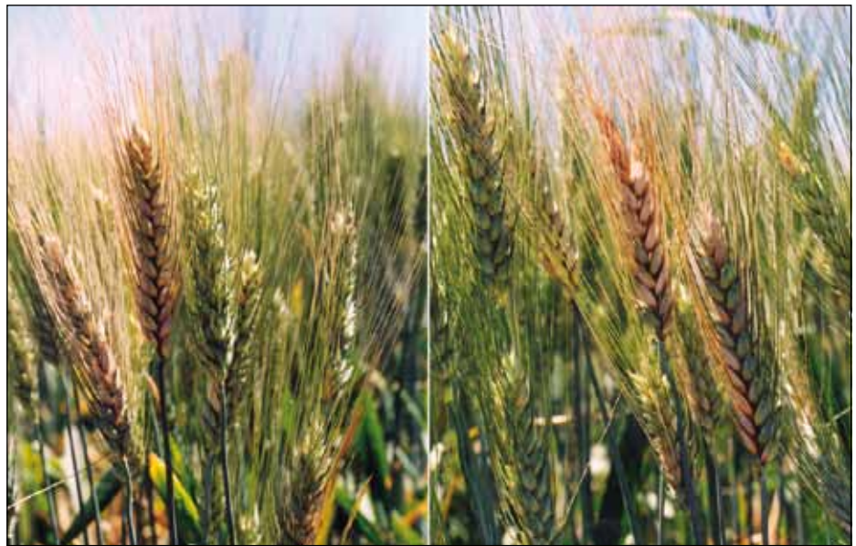
Fusarium head blight of barley.