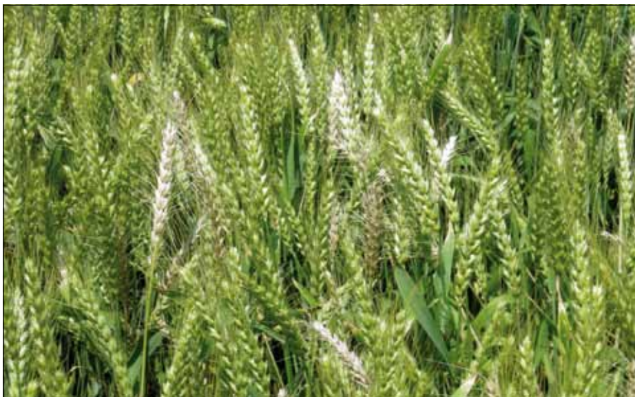
White heads caused by fusarium crown rot of wheat.