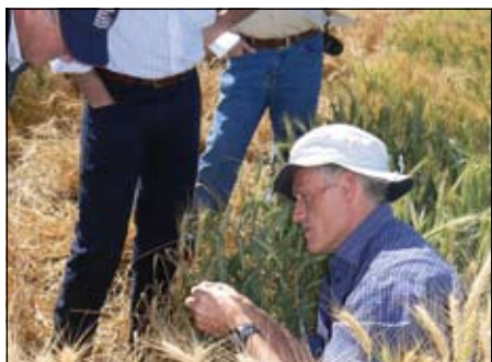
FIGURE 1: GRDC will call for nominations for the new NVT advisory committees in July 2009 - all grains regions will be represented

For more information on the timeline for implementing review recommendations, visit www.grdc.com.au/director/events/onfarmtrials/nvtreview