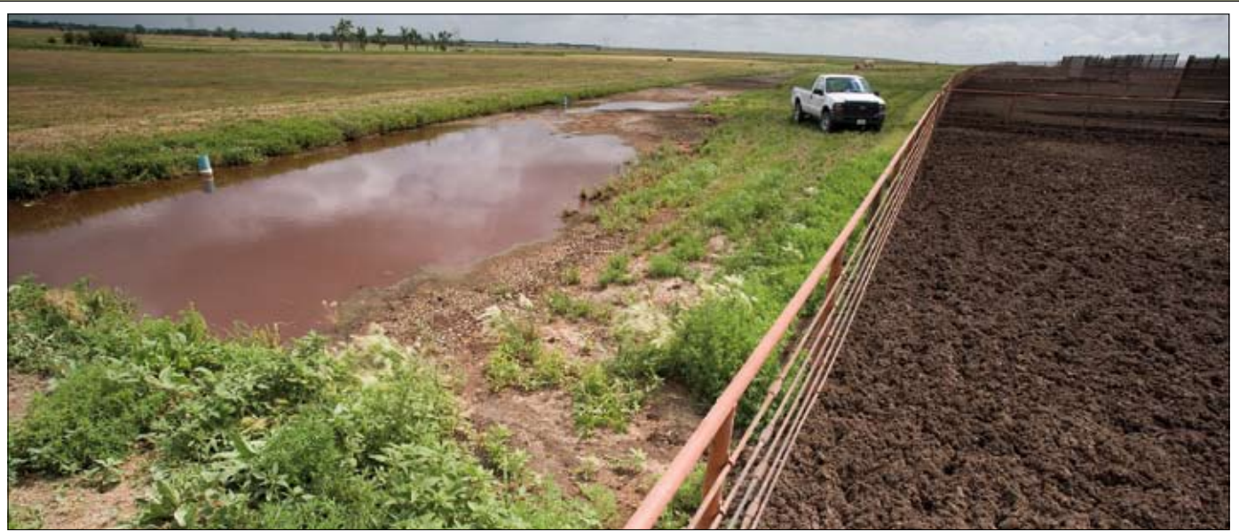
The water on the left collected in a solids-separation basin at the low end of the feedlot pen (on the right) after a rain. After the solids settle, the water in the basin will be distributed throughout the vegetative treatment area.