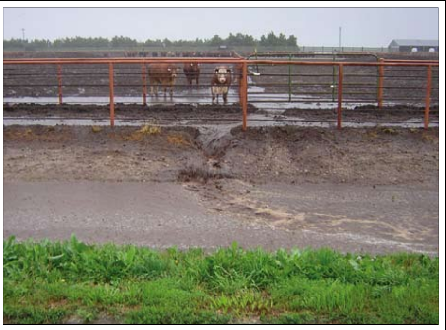
Runoff from a feedlot pen during a rain. The water is heavily laden with sediment from the pen surface.

Distribution of the liquid is controlled so that a full basin would empty in six to eight hours, though the process begins as soon as the liquid separates from the solids in